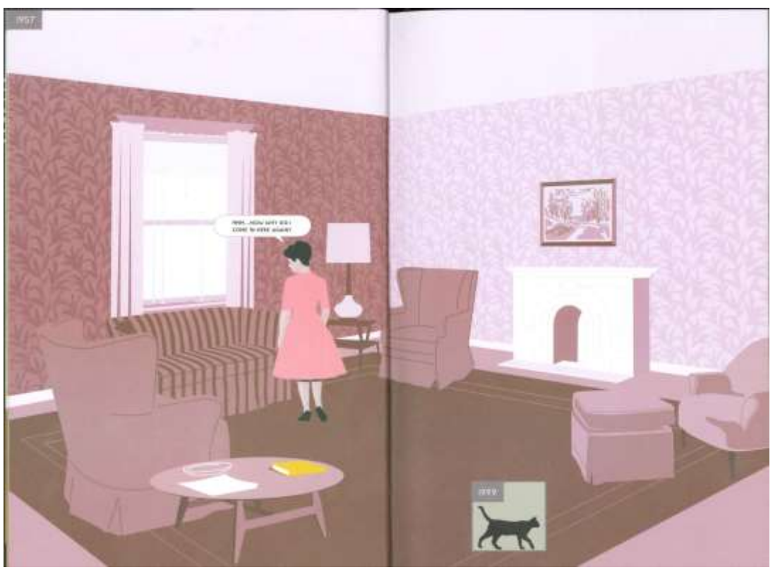
Figure 1. Illustrations from Here by Richard McGuire, copyright © 2014 by Richard McGuire. Used by permission of Pantheon Books, an imprint of the Knopf Doubleday Publishing Group, a division of Penguin Random House LLC. All rights reserved.