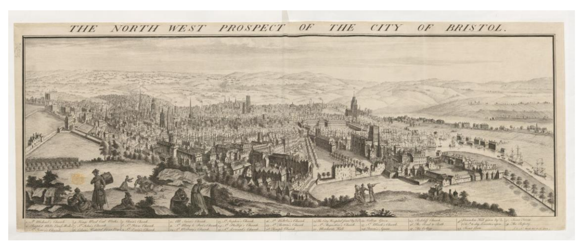
Figure 2. Samuel and Nathaniel Buck. "The North West Prospect of the City of Bristol" (1734a).