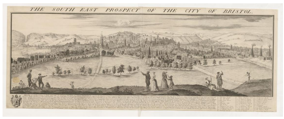
Figure 3. Samuel and Nathaniel Buck. "The South East Prospect of the City of Bristol" (1734b). ©British Library.

century building. Colston's Alms House stemmed from 1691 and the Royal Fort from the Civil War. The city's Tolzey had been there since the middle of the sixteenth century, while both the Guildhall and the High Cross were from the middle of the fourteenth century. Finally, the ornate stone bridge which crossed the Avon had been built in the thirteenth century. It has not been possible to date with certainty all the buildings mentioned by Goldwin, but it is safe to assume that they all fall within these temporal perimeters.